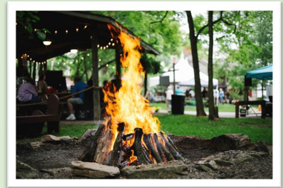
Royer Mansions wedding bonfire

Royer Mansion has two different centuries-built sections with amazing stories to tell. With lush, naturally landscaped ground, your ceremony will have a beautiful backdrop without having to purchase any extras! Let nature paint its own canvas and let us help you to make your wedding day everything you have ever dreamed.